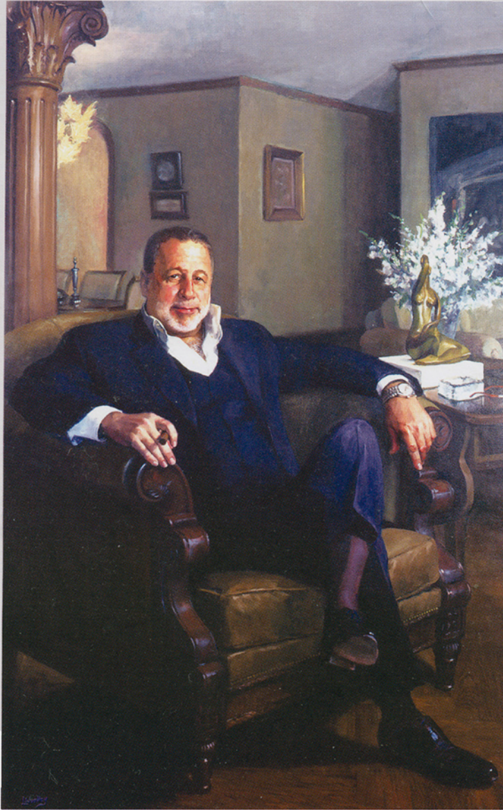
Director, Frontline Communications 69" x 43" Oil