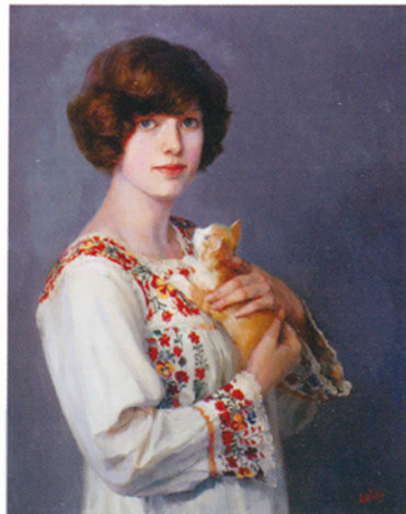
Girl with Kitten 28" x 22" Oil

In Girl with Kitten , the colorful stimulation is in the forefront. Between the beauty of the woman, embroidered blouse and orange kitten, the artist approaches perfection. Her work is reminiscent of a Woodstock predecessor, the 20th century artist Eugene Speicher, whose portraits are included in the permanent collection of the Woodstock Artists Association.