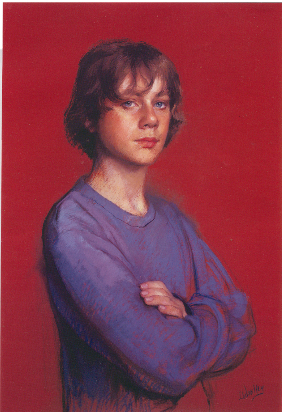
Mathew 28" x 22" Pastel